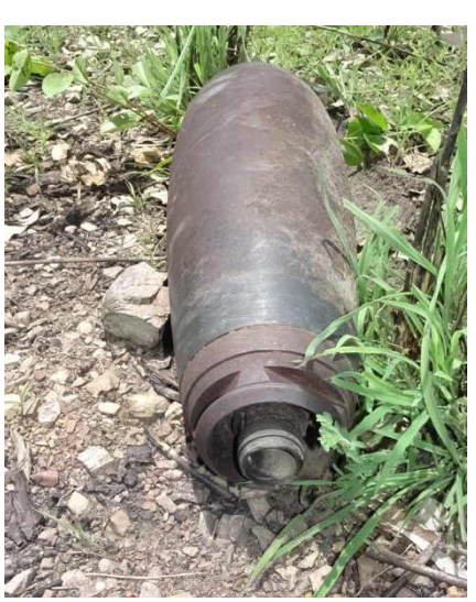
Photographs used are in the public domain. Any use of copyrighted© material is unintentional.