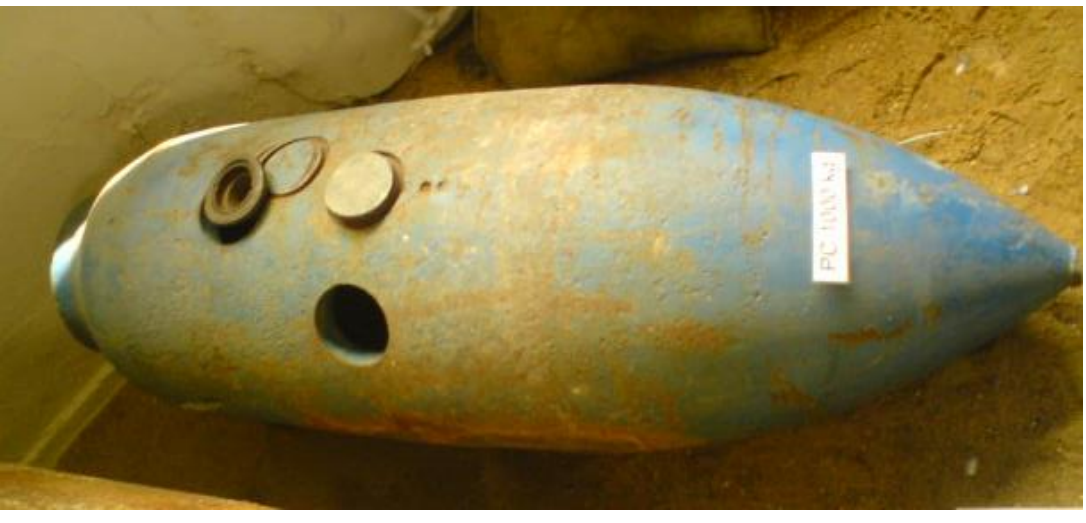
Photographs used are in the public domain. Any use of copyrighted© material is unintentional.