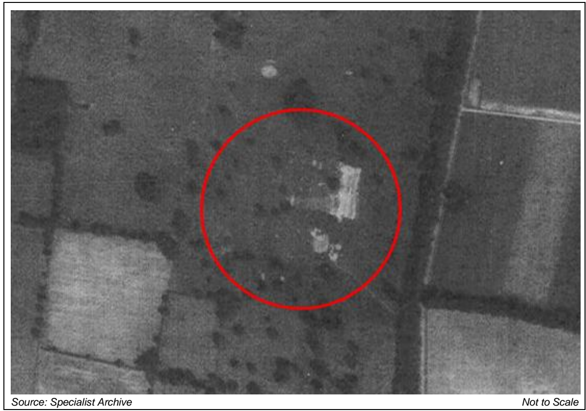
Plate 4: Example of an unrecorded military training area in rural parkland

Without recourse to the aerial photography it is highly likely that this military training area would have been missed, potentially causing severe implications to the developer. At a minimum it would have entailed costs through delays to construction works and could have possibly caused harm to site workers.