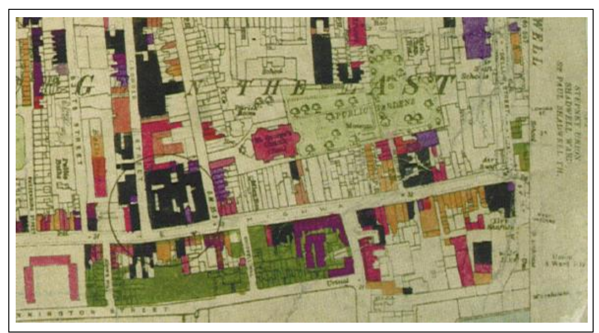
Figure 2: Extract from the London Bomb Damage Map

An example of this is the London bomb damage map which is one of the most commonly used sources of information for UXO risk assessments. It provides a colour-coded plan identifying the severity of bomb damage caused to buildings during WWII. Figure 2 below is an example extract. Essentially, the darker the colour, the more severe the damage. Black indicates a destroyed building, purple, red and pink indicate severe damage, whilst orange and yellow indicate blast damage.