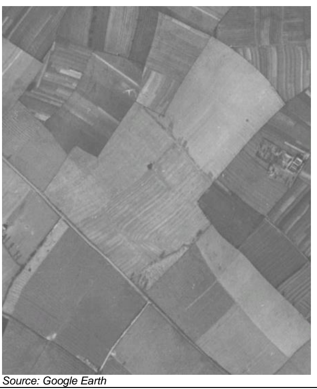
Plate 2: Comparison of sourced aerial photograph of an airfield and Google Earth image