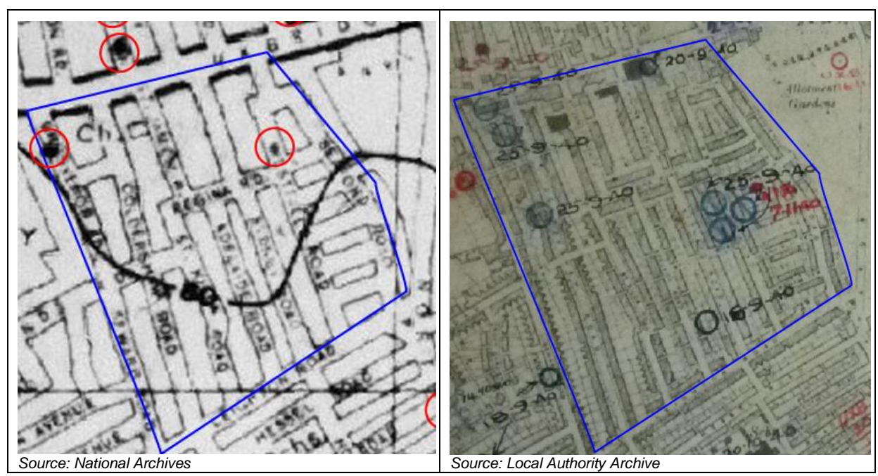
Figure 1: Comparison extracts of bomb census map and local authority bomb map

That the local authority map only covers raids up to January 1941 and the bomb census map purports to include all bomb falls up to July 1941 emphasises the latter's lack of completeness.