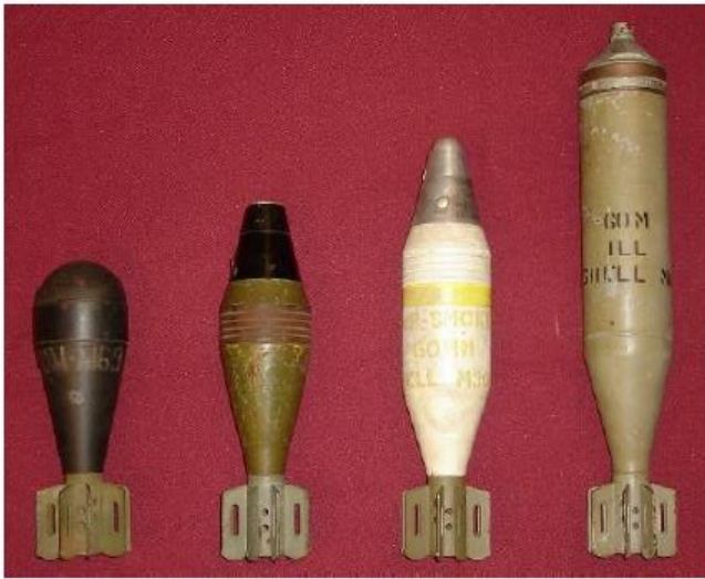
60mm Practice, High Explosive (HE), Incendiary, and Illumination