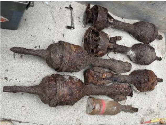
5No. PIATs & 1No. 2" Mortar