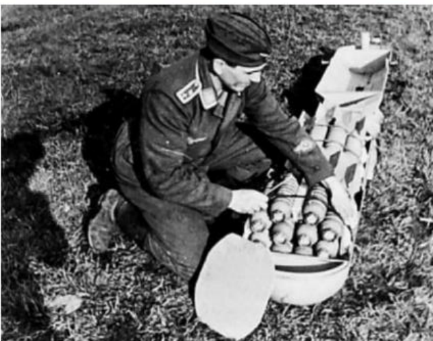
10kg Anti-Personnel Bomb variants in sub-munition container