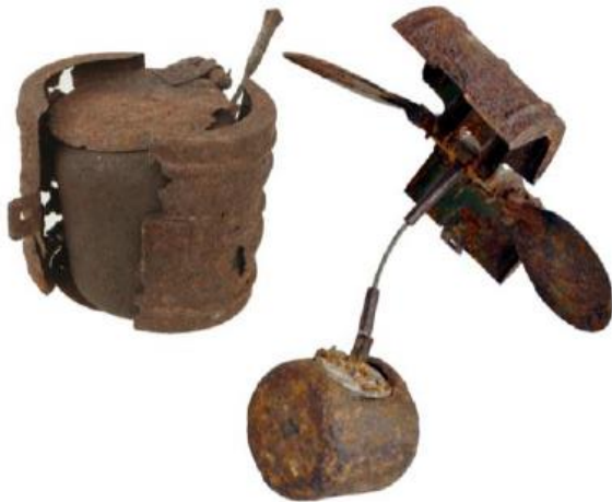
2kg Anti-Personnel Bomb in closed and open configurations