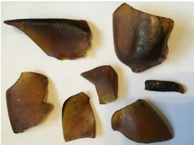
Glass fragments from Phosphorus Incendiary Bomb