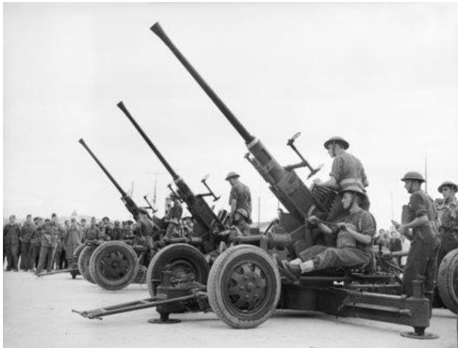
WWII LAA gun